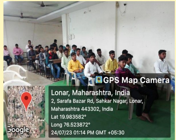
Students participation in Student Induction Program (SIP)