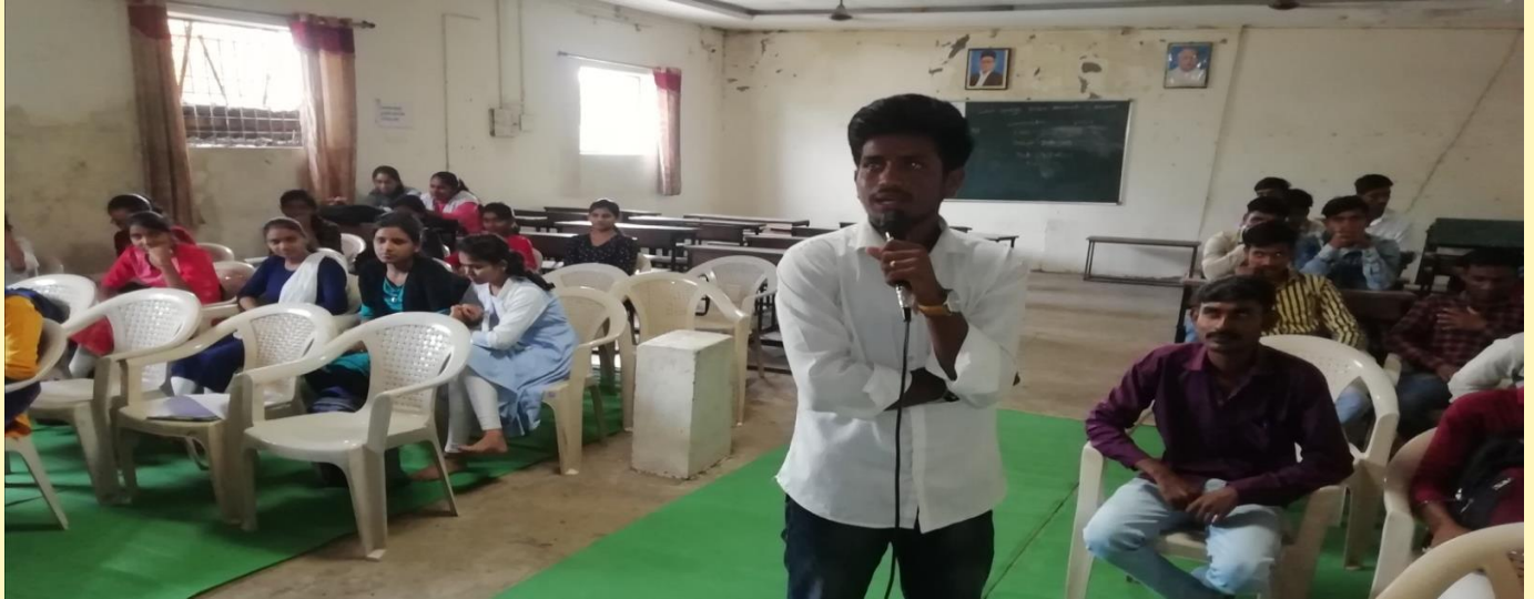
Feedback given by participated students on Student Induction Program at valedictory