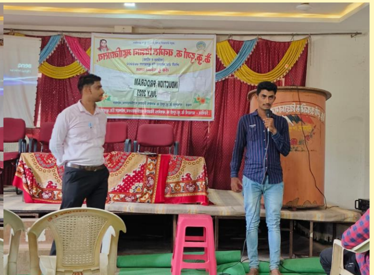
Introduction of each student himself