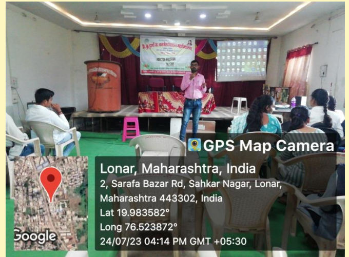
Introduction of each department by respective HOD & faculty members