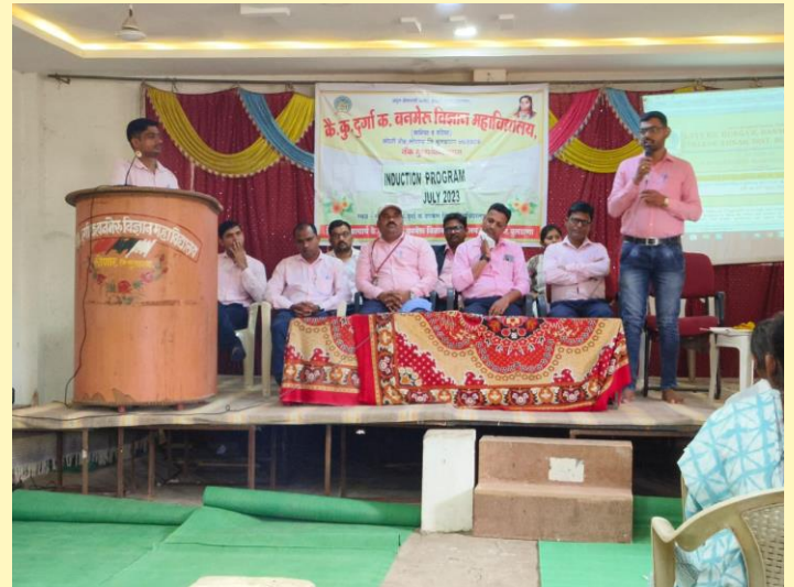
Introduction of all teaching & non-teaching staff to newly admitted students