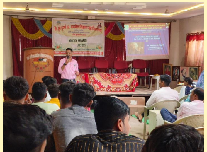
Introduction of each department by respective HOD & faculty members