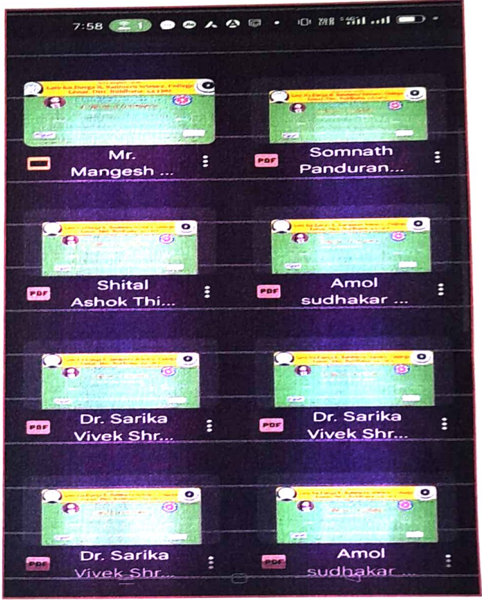
E-Certificate online issue through google drive