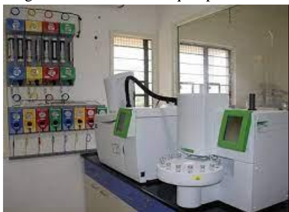
Gas-liquid chromatography (GLC),