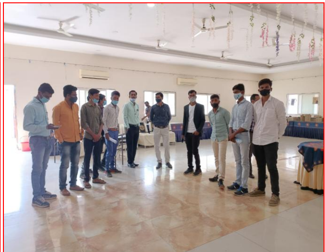
Student taking information about different types of rooms and party ware hall