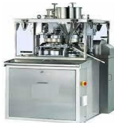
Tablet punching machine