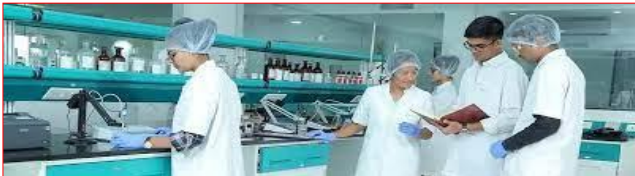
QC Department Ajanta Pharma