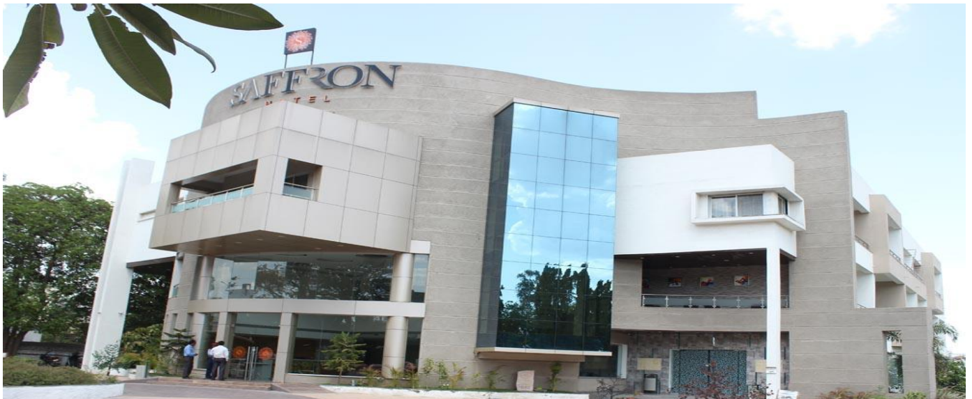
Hotel Sffron Jalna