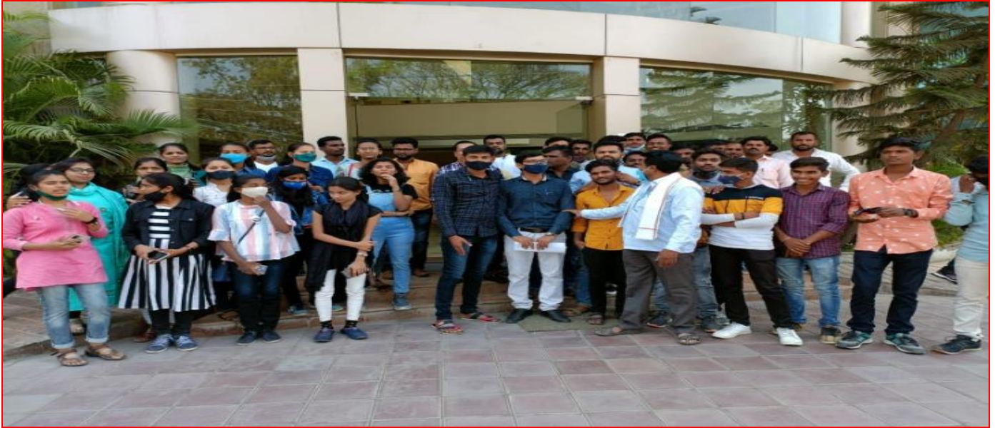
Student visited to Hotel Saffron Jalna