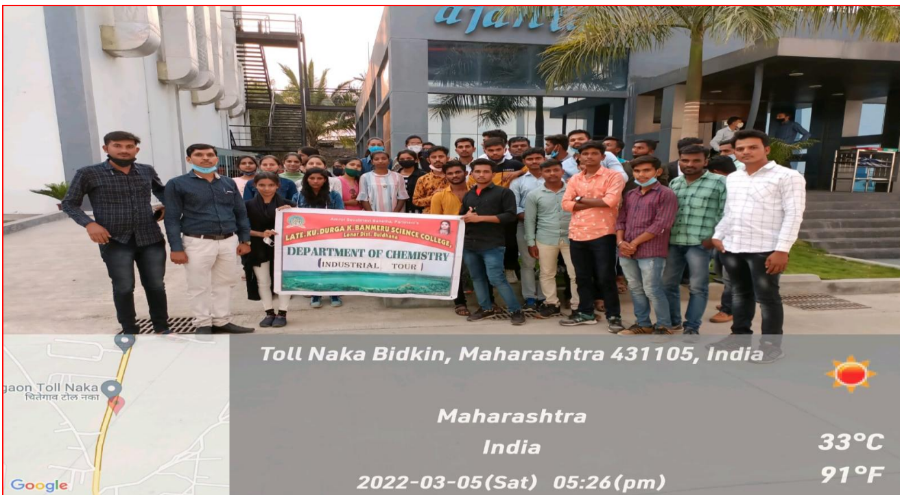
Visit to Ajanta Pharma plant Chittagaon Aurangabad (MS)