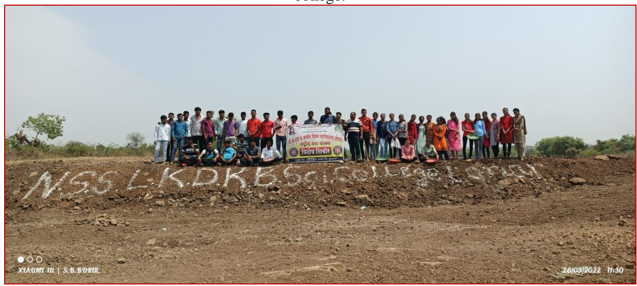
After completion of Shramdan, everyone took a picture on the wall of the dam happy.