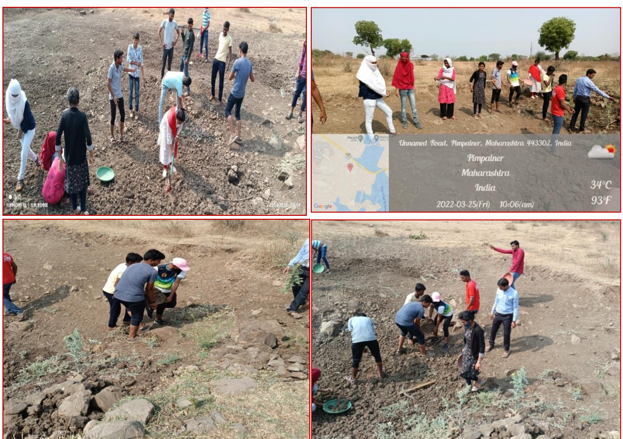
While deepening the dam, stones are carried to the edge