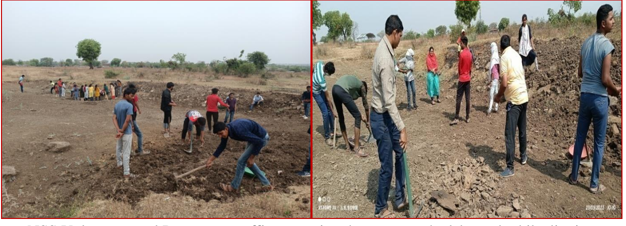
NSS Volunteers and Programme officers cutting the grass on the lake and while digging