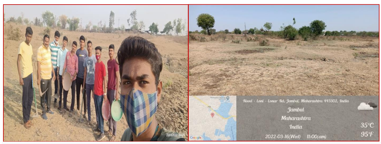
A photograph of the dam before it was dyke construction and refilled

Volunteers of National Service Scheme Department constructed a construction of dyke and refilled the dam at adopted village Pimpalner. Two groups of NSS students were given the responsibility of replenishing the dam. After that, the dam wall was totally cleared of all vegetation, a wall about 95 to 100 feet long was drawn, and work began on it. On this wall, dirt, debris, and stones were flung. The volunteers cleared the lake of all silt and broken stones, throwing them in a public area. The excavation wall also received dirt.