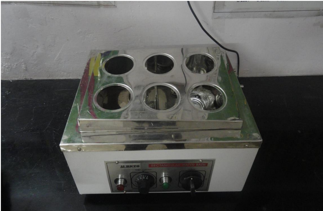
Hot Water Bath