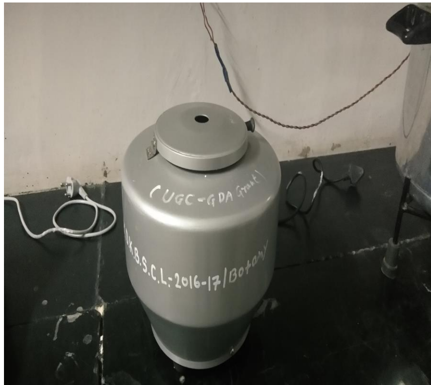
Remi Centrifuge Machine 5000 rpm