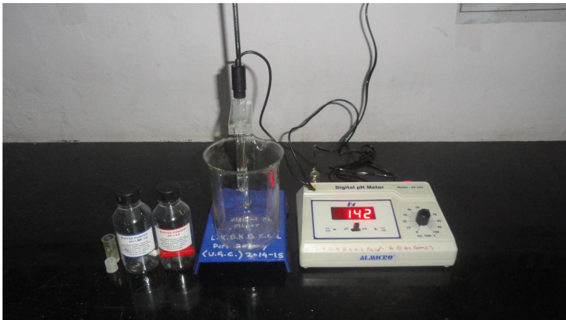
Digital pH Meter