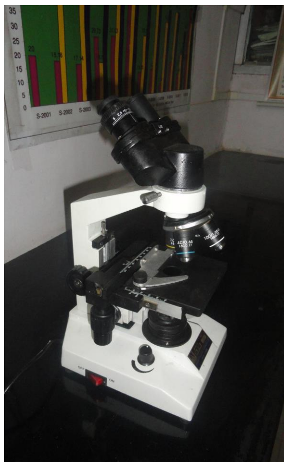
Binocular Research Microscope