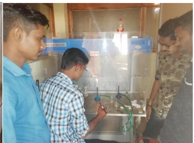
B.Sc. III yr students performing Plant Tissue Culture on Laminar Air Flow Chamber