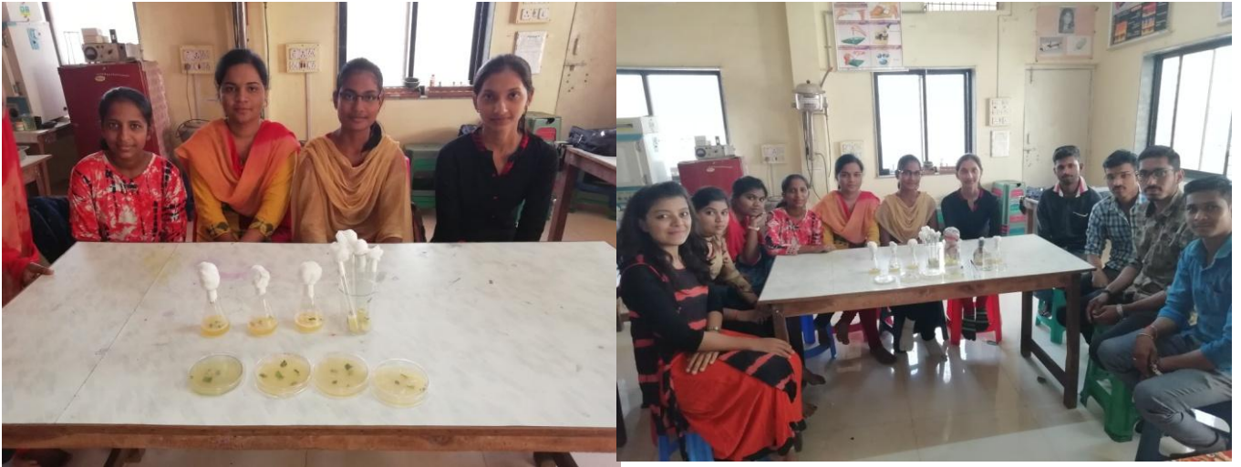
Plant Tissue Culture performed by B. SC III yr (Botany) students