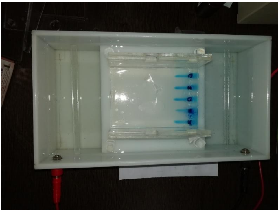
Gel Electrophoresis performed by B. Sc. III yr students for separation of Proteins