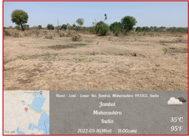
A photograph of the dam before it was dyke construction and refilled