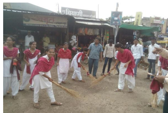
Students while doing cleaning on roads of Lonar city.