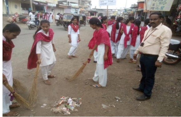
Students are doing cleaning on roads of Lonar city.