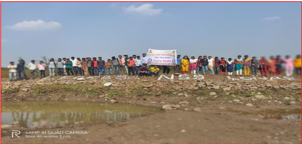
The entire NSS squad along with the pond created by refilling the labor donation,

Shramadan (Labour Contribution/Donation):- In the adopted village Pimplaner, the pond was refilled to the west of the village. In this, the entire pond was voluntarily filled for 7 days. Also, by digging at some places, the volunteers broke the stones. On the other hand, about 90 to 95 feet on the wall of the pond, the wall of the pond was raised by adding 5 to 3 feet of soil and stone pitching was also done. Also the shed was lowered in such a way that the water flows properly. Today the work of filling the pond was completed by putting stones on the entire wall of this lake. The water of this lake will benefit the village and the wild animals and other wild birds.