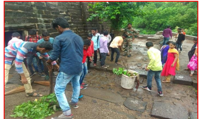
NSS volunteers collect cloths, garbage, etc in crater