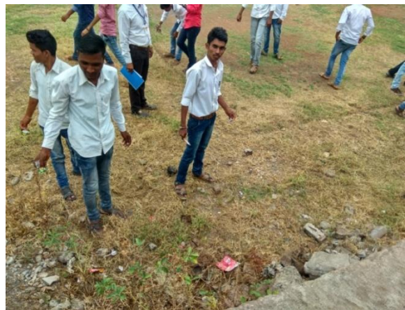
Plastik Free Campagion