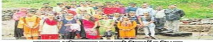
स्वच्छता अभियानात सहभागी विद्यार्थी व शिक्षक