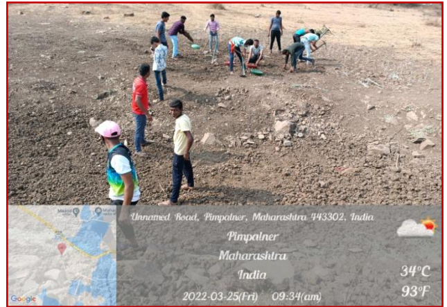
Volunteers standing in queues digging soil from the pond, filling shovels and dumping it on the wall.