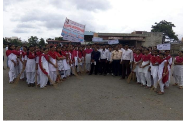
Students are doing the cleaning on Bus stand.