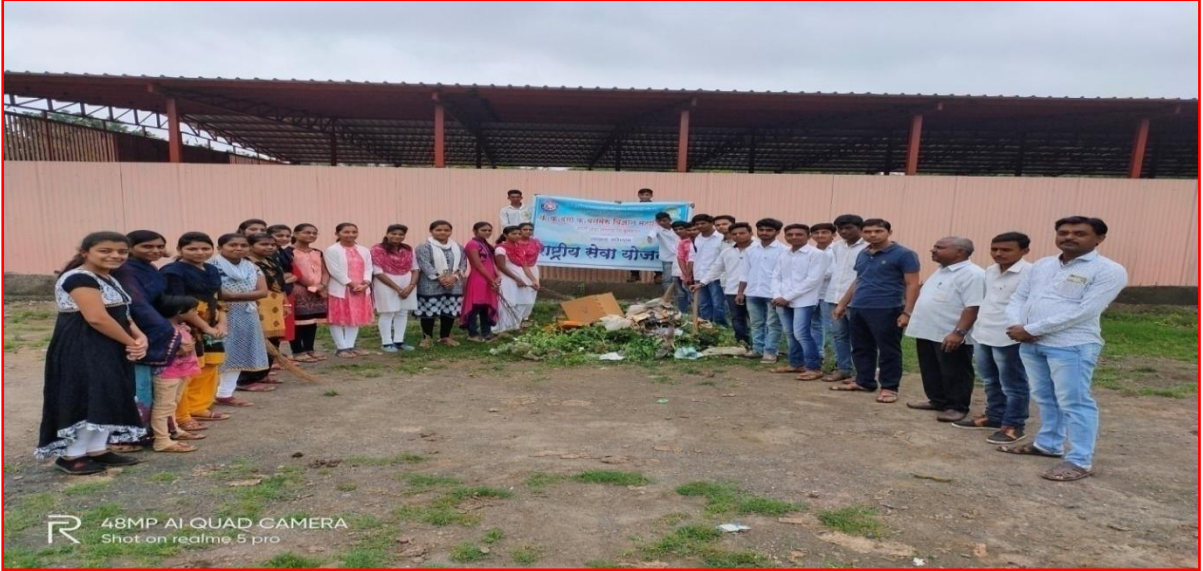
Garbage collected by volunteers of NSS

On 10 th September 2019 Volunteers of NSS carried out carrot grass eradication and plastic removal campaign at Panchayat Samiti premises of Lonar.