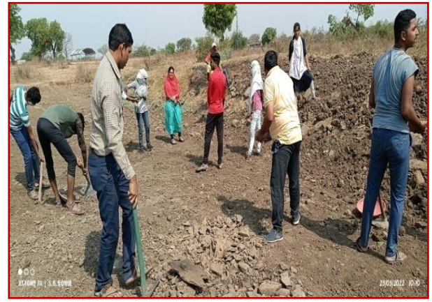
NSS Volunteers and Programme officers cutting the grass from the field while digging

Volunteers dug 15 to 20 feet long and 2 to 2.5 feet deep along the side of the pond and filled it. NSS volunteers deepening the lake and stones are carried to the edge. This year, due to the labor done by the volunteers, the water supply has definitely increased, which will help in increasing the water level of wells and borewells in the area. Also, water will be available for animals to drink and greenery will grow in the area.