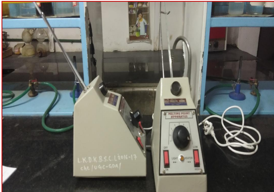
Melting Point Apparatus