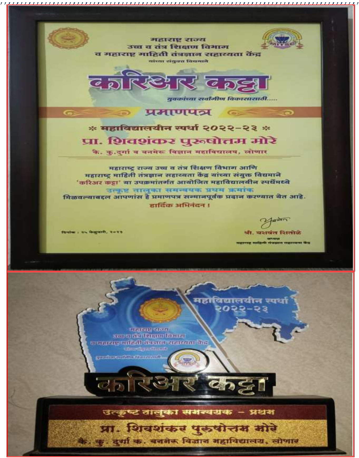
Certificate of honor